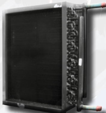
With E-Coat Coating